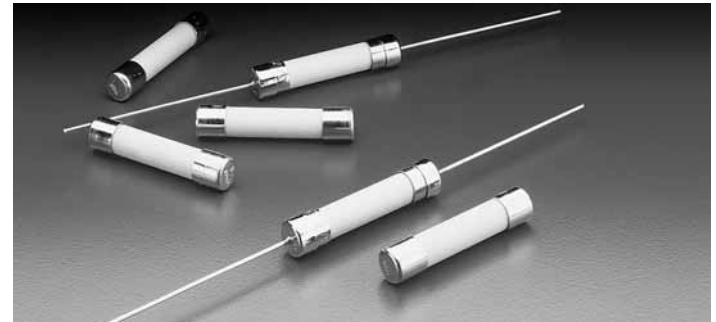
314 000 Series